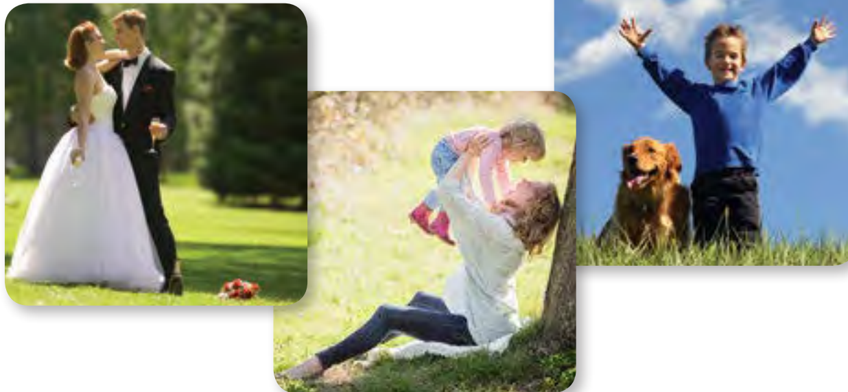
Image size: 3.75"x 3.75"

Set includes 4 pieces. Wooden stand included. Made of high-gloss, white hard board with cork backing.