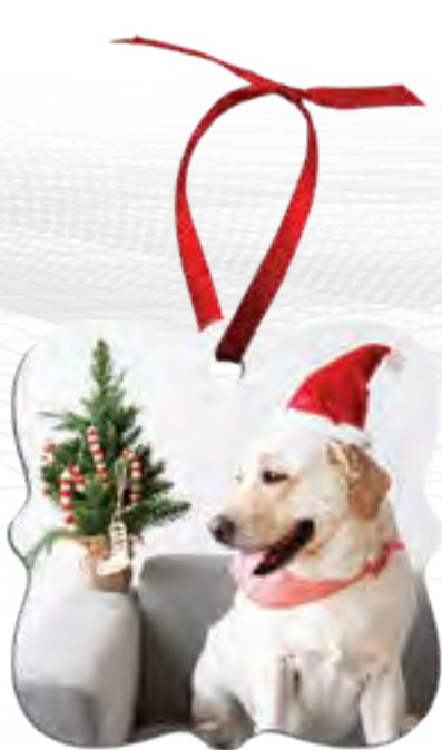
Berlin - 4"x 3"

Shapes available: Benelux, Circle, Paw print, Star, Bell, Prague (as above), Berlin (as above), Rectangle, Oval, Hexagon, Creative Border.