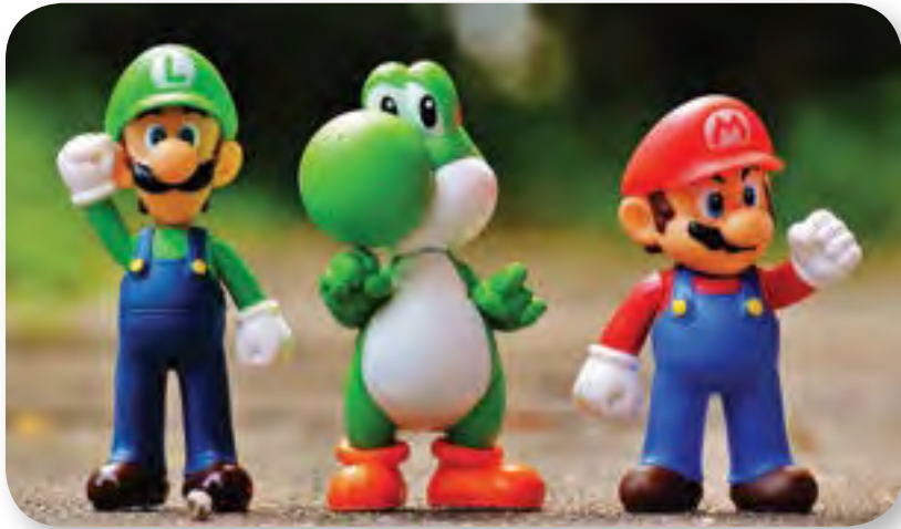
Gaming Mat 14 x 24